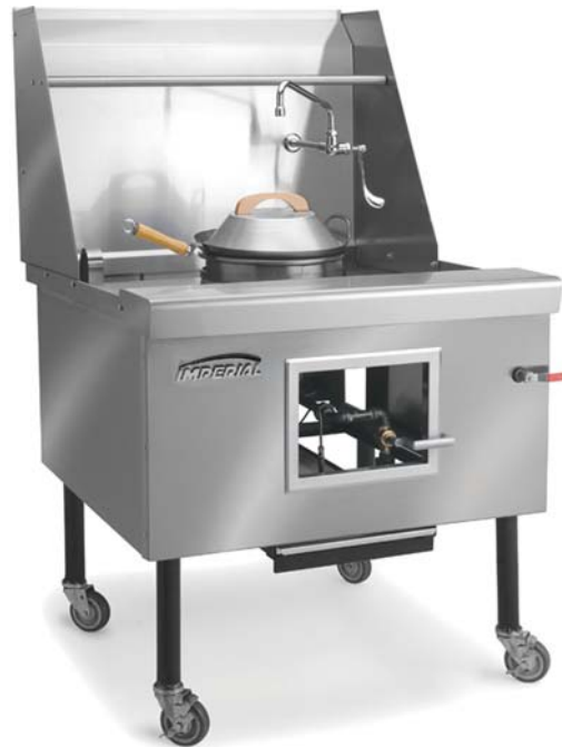
ICRA-1 shown with optional casters

3-ring burner has two adjustable gas valves for inner and outer rings.